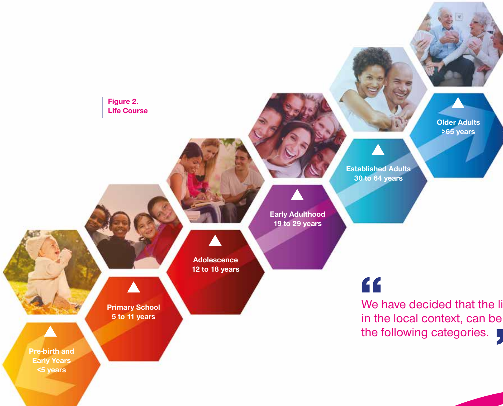
Figure 2. Life Course