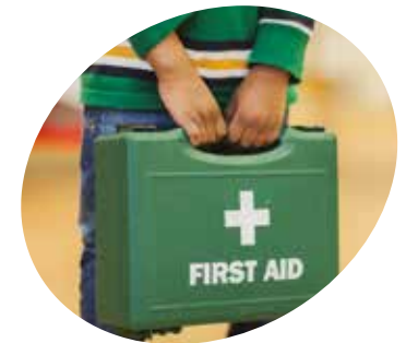
Protection and Safeguarding