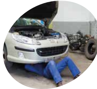
The Work Place