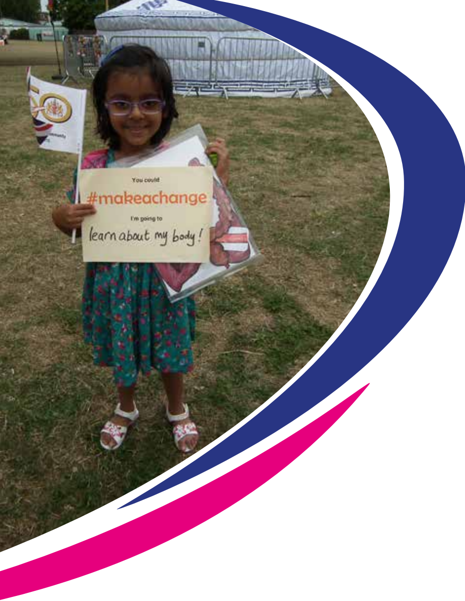
Front cover image: Residents gather in celebration on the day that HRH Queen Elizabeth opens the Abbey Leisure Centre, 16 July 2015.